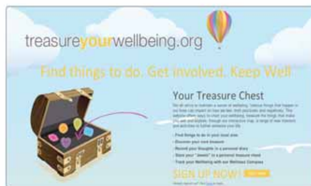
Designed to encourage recovery amongst mental health service users and promote wellbeing amongst the general public.